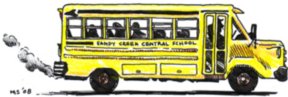
Sandy Creek Central School